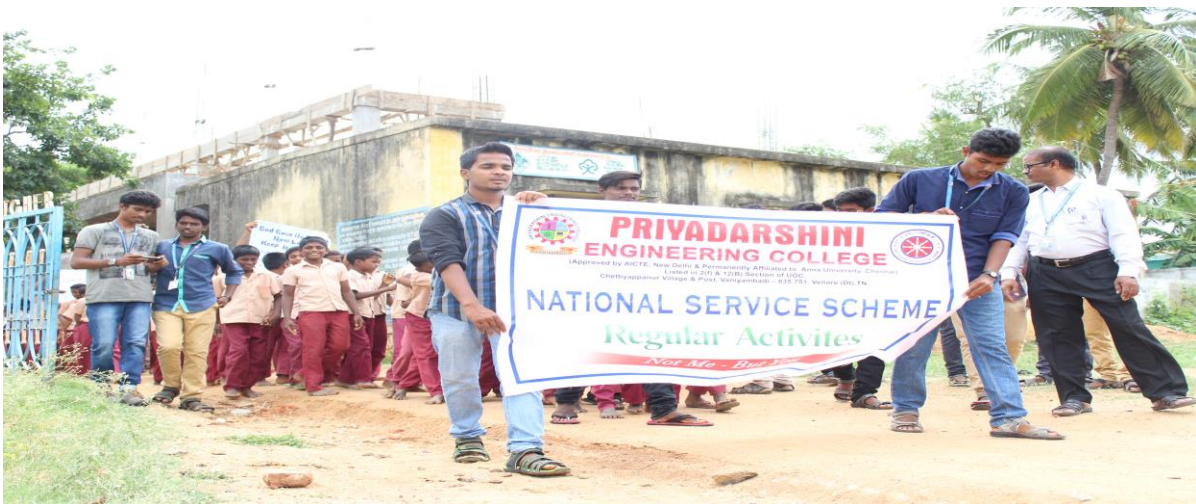
NSS Volunteers, NSS Programme Officers of Priyadarshini Engineering College Vaniyambadi, Rotary club Vaniyambadi Vellakuttai Government Higher Secondary School Students and Staffs are participated in Swachh Bharat Summer Internship Awareness Campaign in Vellakuttai Village.