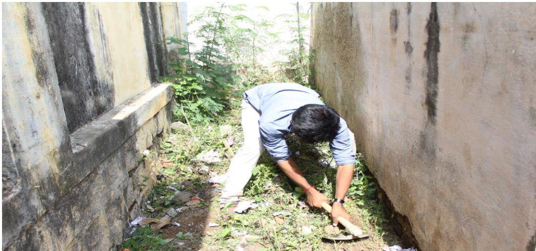
NSS Volunteers of Priyadarshini Engineering College, Vaniyambadi organize cleaning of streets and back alleys in Vellakuttai Village. (Before)