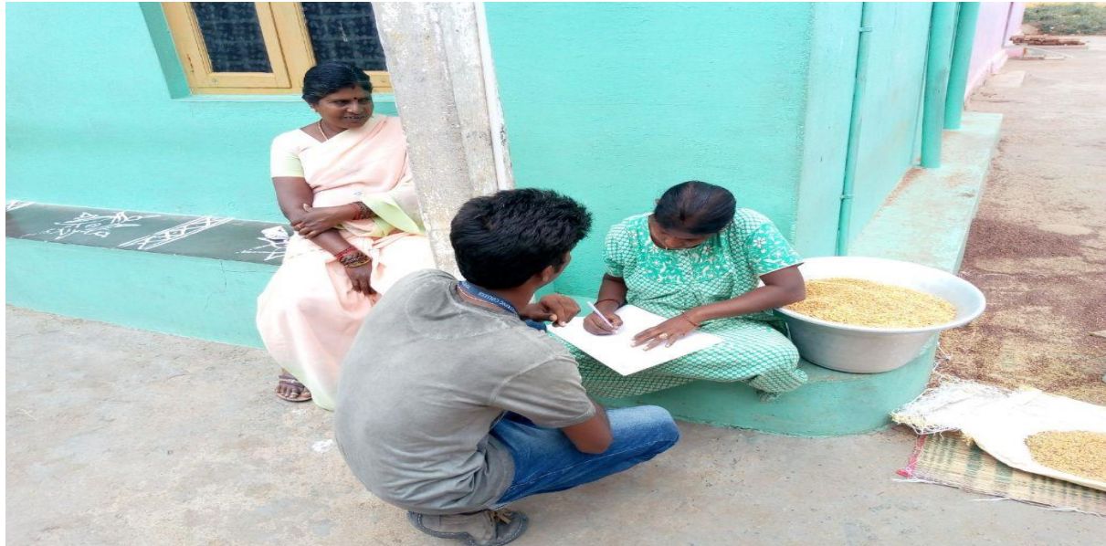
Door-to-Door meeting creating awareness of Vellakuttai Village people about sanitation related issues.