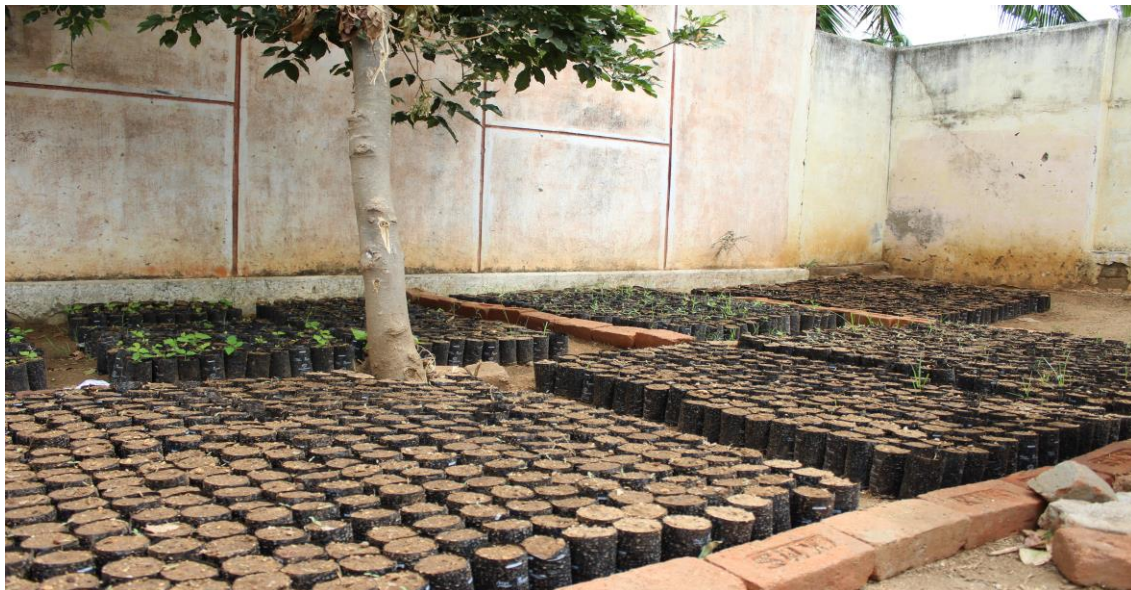
Nurturing tree saplings to the Government Higher Secondary School Vellakuttai