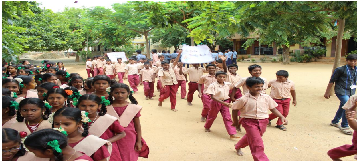
Awareness Campaign in Vellakuttai Village.