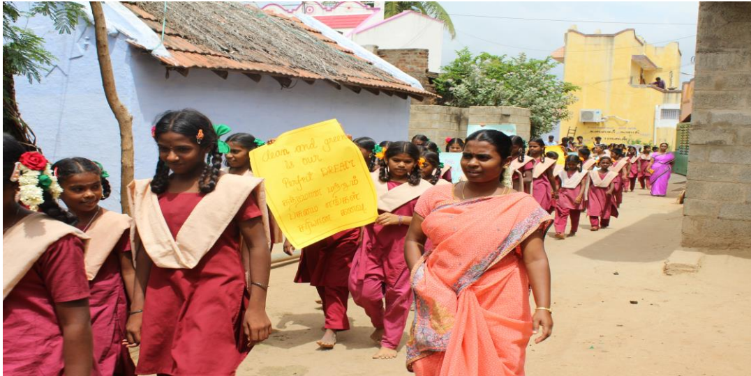
Awareness Campaign in Vellakuttai Village.