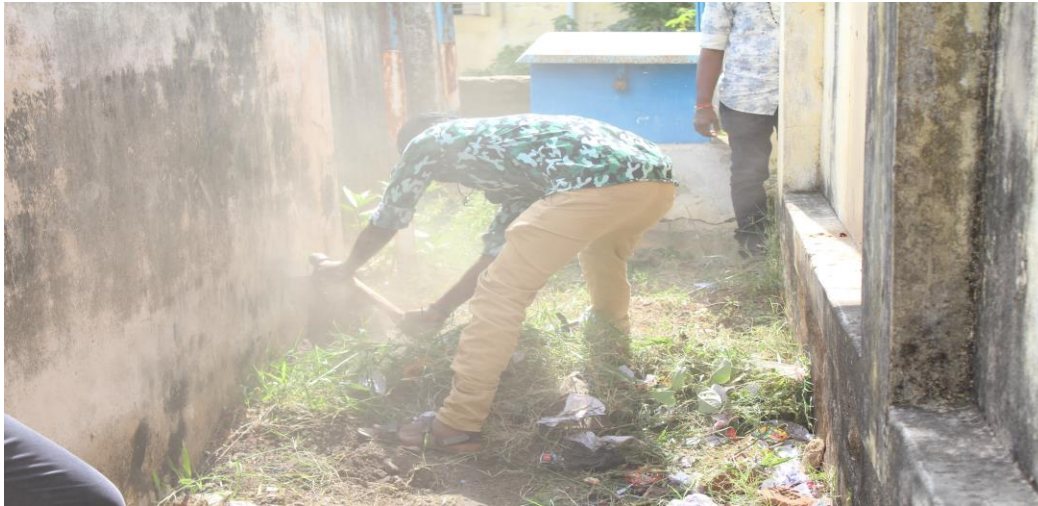
NSS Volunteers of Priyadarshini Engineering College, Vaniyambadi organize cleaning of streets and back alleys in Vellakuttai Village. (Before)