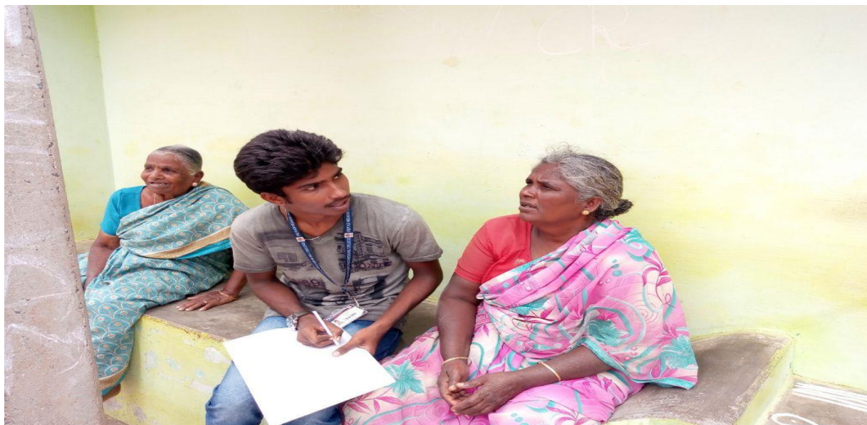
Door-to-Door meeting creating awareness of Vellakuttai Village people about sanitation related issues.