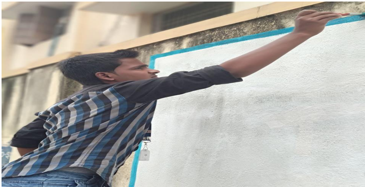
NSS Volunteers of Priyadarshini Engineering College made wall painting on the walls of Government Higher Secondary School Vellakuttai, Vellakuttai Village on theme of swachhata.