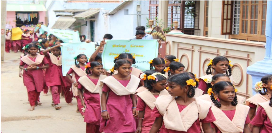
Awareness Campaign in Vellakuttai Village.