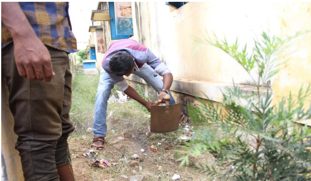
NSS Volunteers of Priyadarshini Engineering College, Vaniyambadi organize cleaning of streets and back alleys in Vellakuttai Village. (Before)