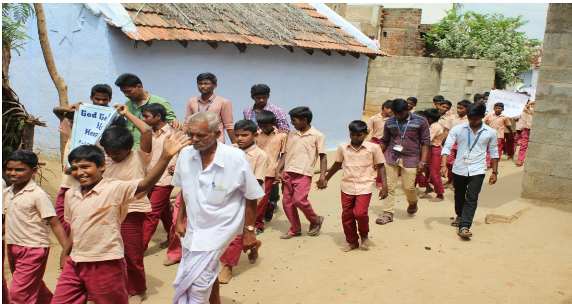
Awareness Campaign in Vellakuttai Village.