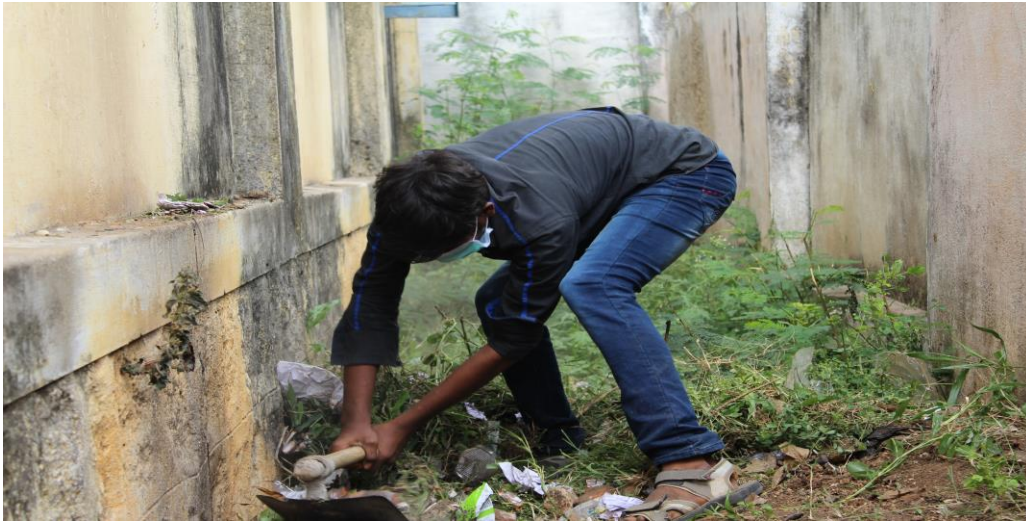
NSS Volunteers of Priyadarshini Engineering College, Vaniyambadi organize cleaning of streets and back alleys in Vellakuttai Village. (Before)