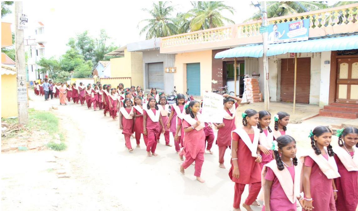
Awareness Campaign in Vellakuttai Village.