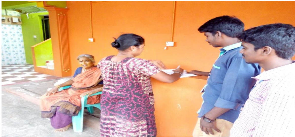
Door-to-Door meeting creating awareness of Vellakuttai Village people about sanitation related issues.