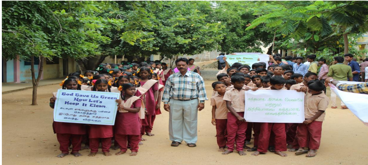
NSS Volunteers, NSS Programme Officers of Priyadarshini Engineering College Vaniyambadi, Rotary club Vaniyambadi Vellakuttai Government Higher Secondary School Students and Staffs are participated in Swachh Bharat Summer Internship Awareness Campaign in Vellakuttai Village.