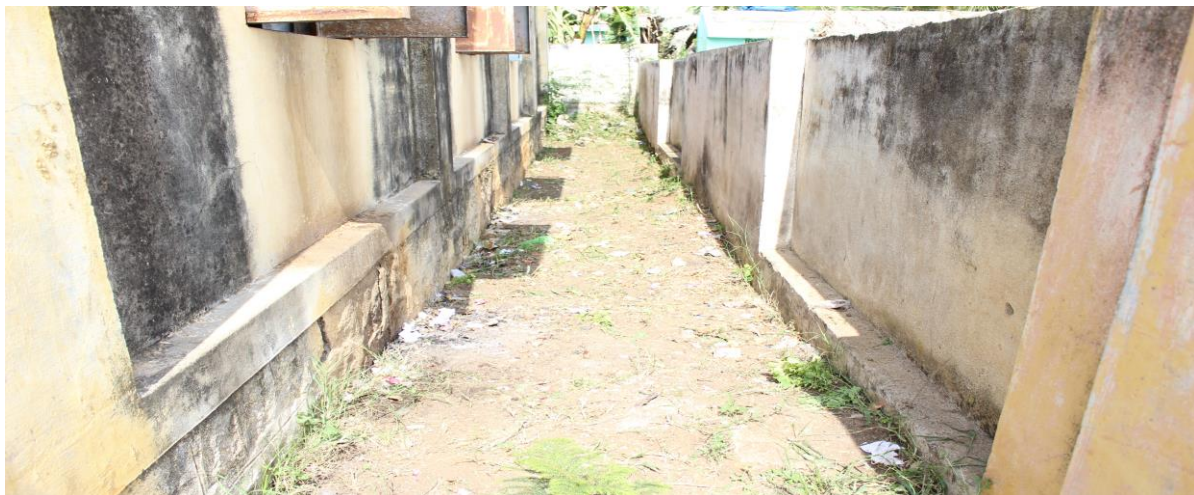
NSS Volunteers of Priyadarshini Engineering College, Vaniyambadi organize cleaning of streets and back alleys in Vellakuttai Village. (After)