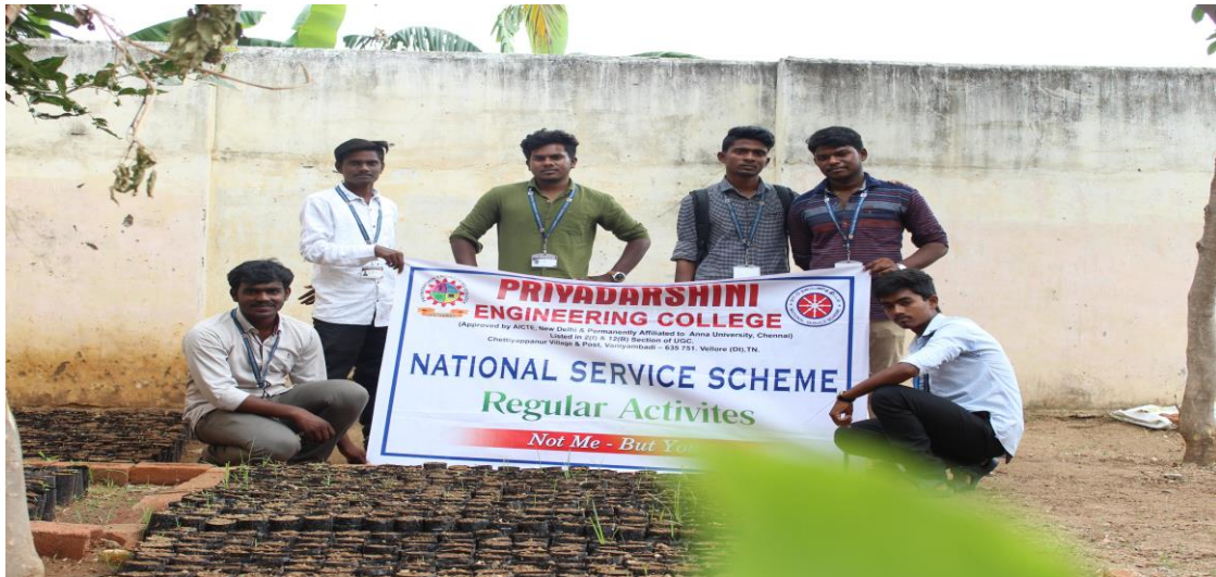
Nurturing tree saplings to the Government Higher Secondary School Vellakuttai