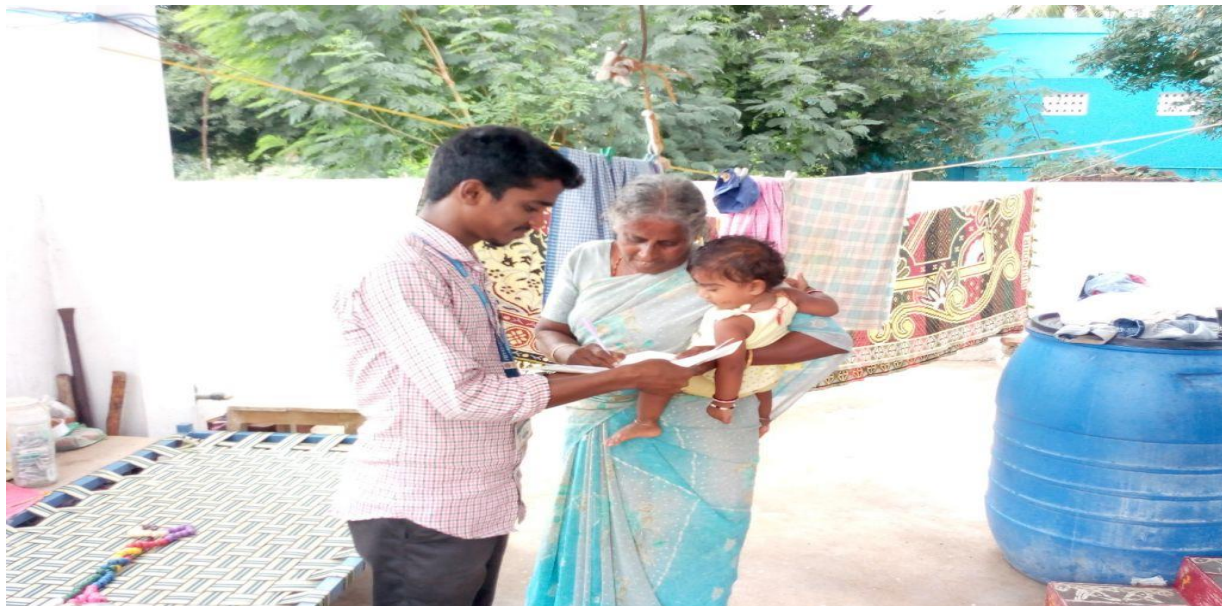
Door-to-Door meeting creating awareness of Vellakuttai Village people about sanitation related issues.