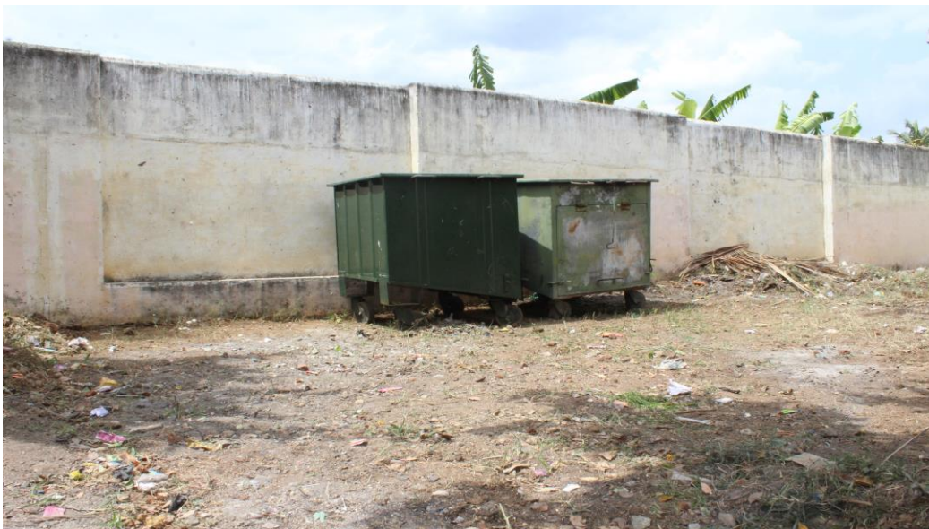
NSS Volunteers of Priyadarshini Engineering College, Vaniyambadi collecting the solid waste in Government Higher Secondary School, Vellakuttai. (After)