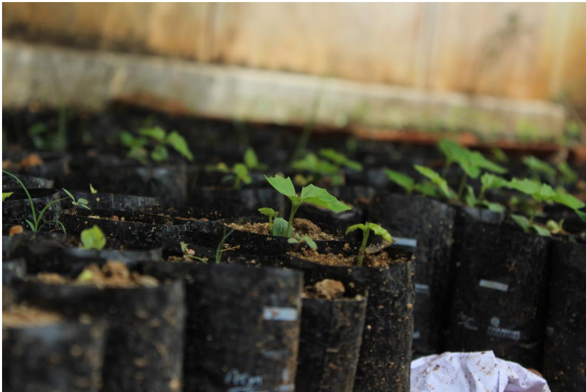
Nurturing tree saplings to the Government Higher Secondary School Vellakuttai