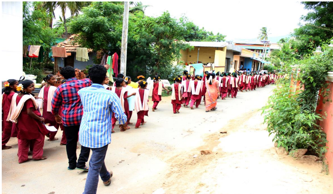
Awareness Campaign in Vellakuttai Village.