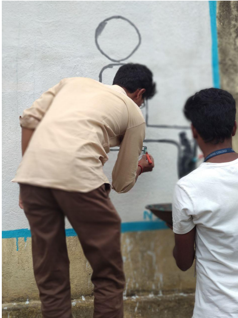
NSS Volunteers of Priyadarshini Engineering College made wall painting on the walls of Government Higher Secondary School Vellakuttai, Vellakuttai Village on theme of swachhata.