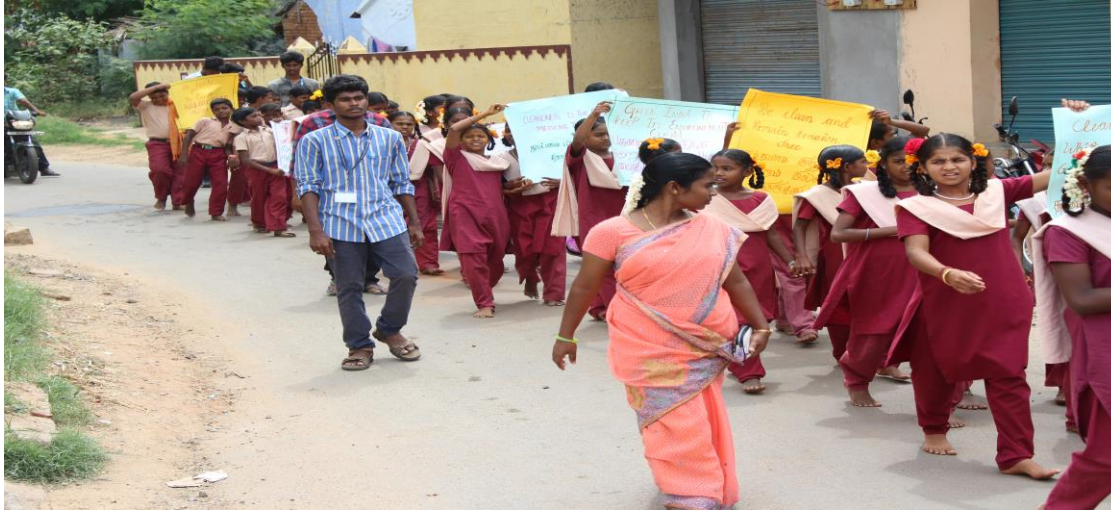
Awareness Campaign in Vellakuttai Village.