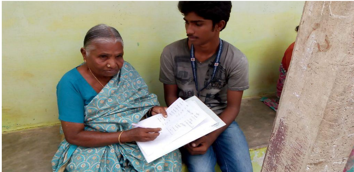
Door-to-Door meeting creating awareness of Vellakuttai Village people about sanitation related issues.