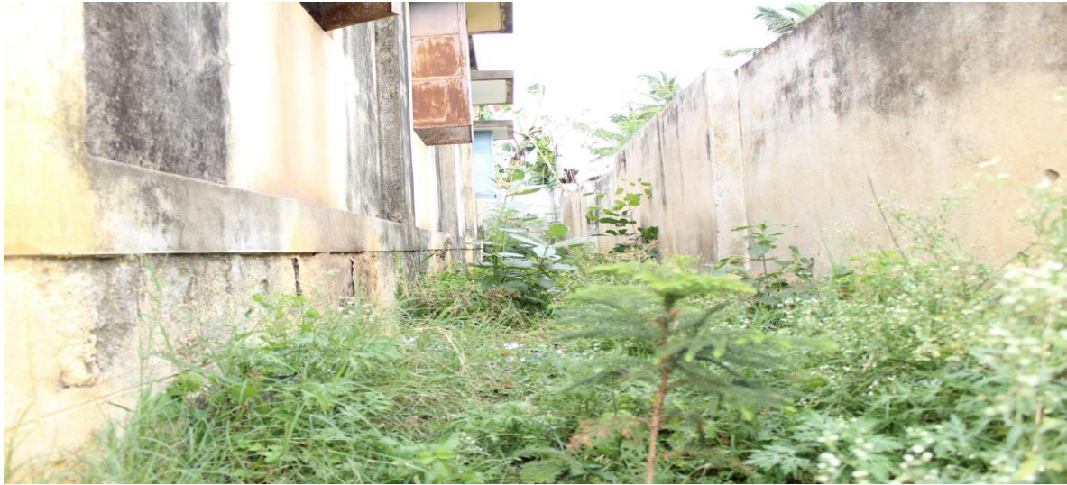
NSS Volunteers of Priyadarshini Engineering College, Vaniyambadi organize cleaning of streets and back alleys in Vellakuttai Village. (Before)