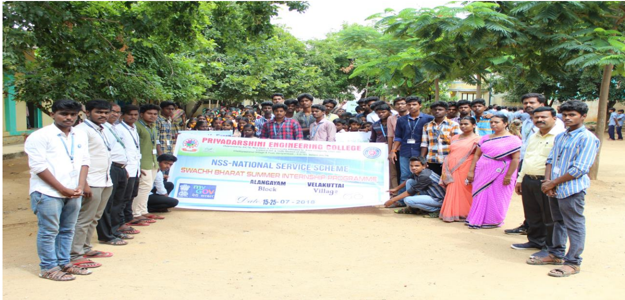
NSS Volunteers, NSS Programme Officers and Vallipattu Government Higher Secondary School Students and Staffs are participated in Swachh Bharat Summer Internship Awareness Campaign in Vellakuttai Village.