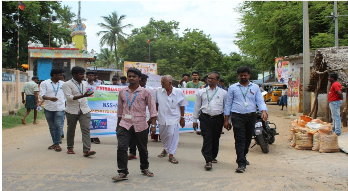
Awareness Campaign in Vellakuttai Village.