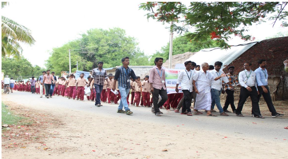
Awareness Campaign in Vellakuttai Village.