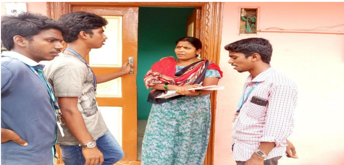
Door-to-Door meeting creating awareness of Vellakuttai Village people about sanitation related issues.