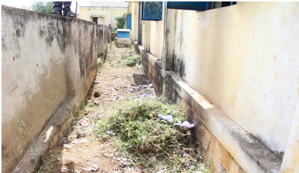
NSS Volunteers of Priyadarshini Engineering College, Vaniyambadi organize cleaning of streets and back alleys in Vellakuttai Village. (After)