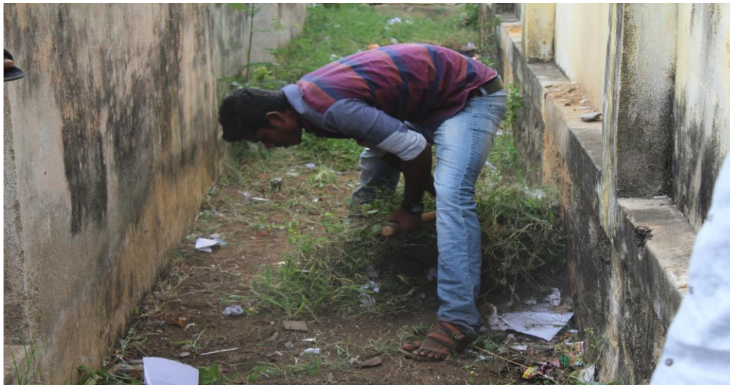
NSS Volunteers of Priyadarshini Engineering College, Vaniyambadi organize cleaning of streets and back alleys in Vellakuttai Village. (Before)