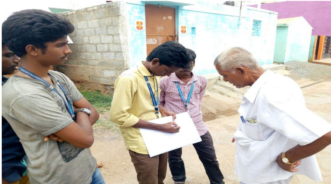
Door-to-Door meeting creating awareness of Vellakuttai Village people about sanitation related issues.