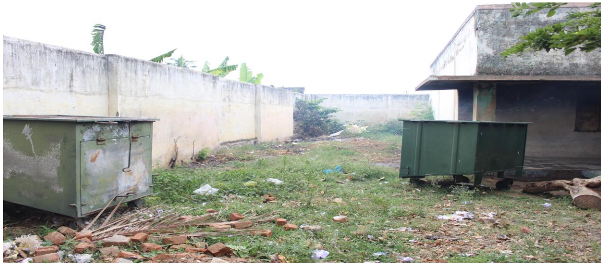
NSS Volunteers of Priyadarshini Engineering College, Vaniyambadi organize cleaning of streets and back alleys in Vellakuttai Village. (Before)