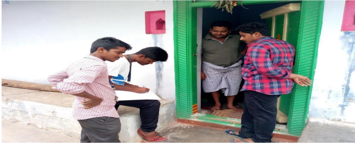
Door-to-Door meeting creating awareness of Vellakuttai Village people about sanitation related issues