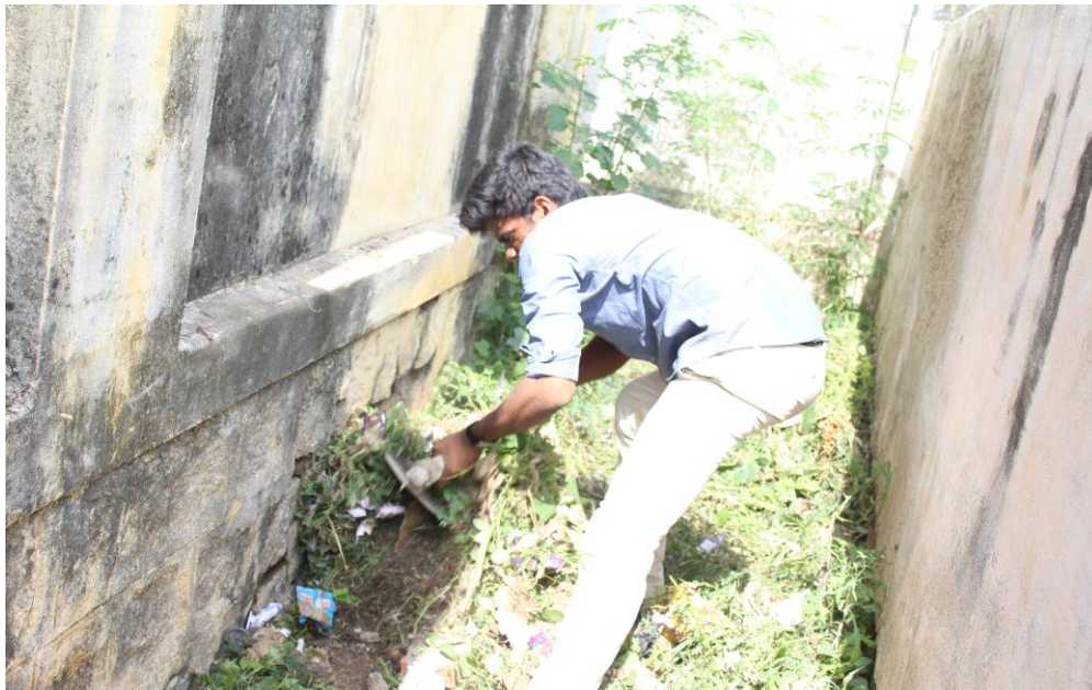
NSS Volunteers of Priyadarshini Engineering College, Vaniyambadi organize cleaning of streets and back alleys in Vellakuttai Village. (Before)