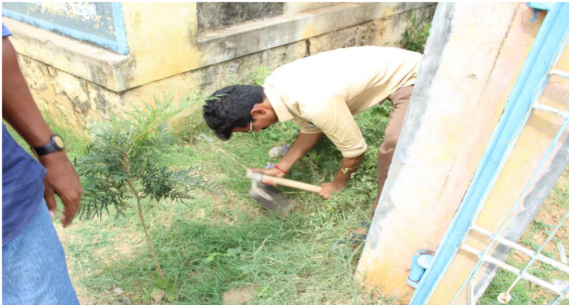
NSS Volunteers of Priyadarshini Engineering College, Vaniyambadi organize cleaning of streets and back alleys in Vellakuttai Village. (Before)