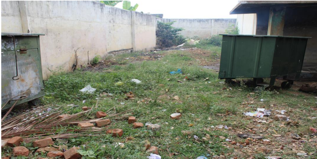
NSS Volunteers of Priyadarshini Engineering College, Vaniyambadi collecting the solid waste in Government Higher Secondary School, Vellakuttai. (Before)