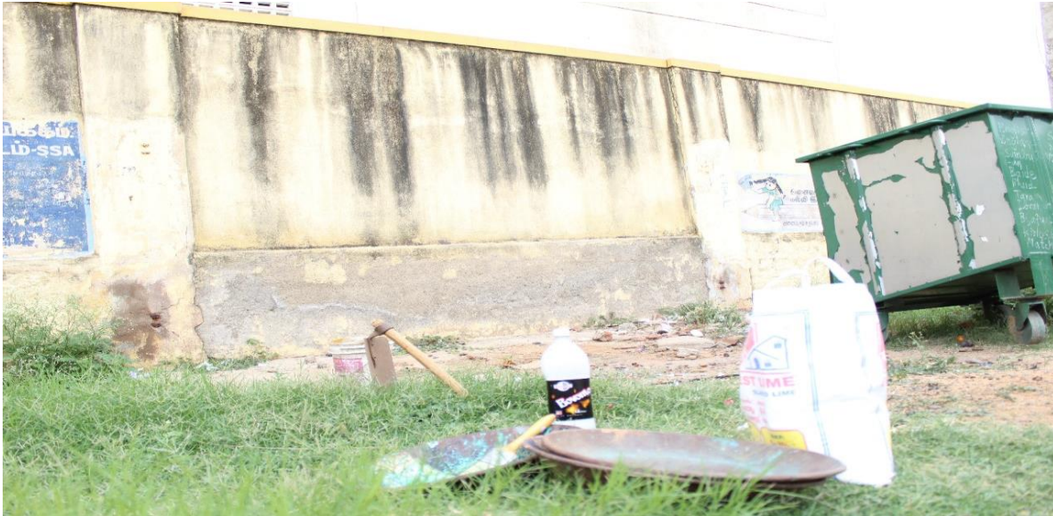
NSS Volunteers of Priyadarshini Engineering College made wall painting on the walls of Government Higher Secondary School Vellakuttai, Vellakuttai Village on theme of swachhata. (Before)