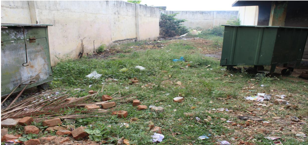
NSS Volunteers of Priyadarshini Engineering College, Vaniyambadi organize cleaning of streets and back alleys in Vellakuttai Village. (Before)