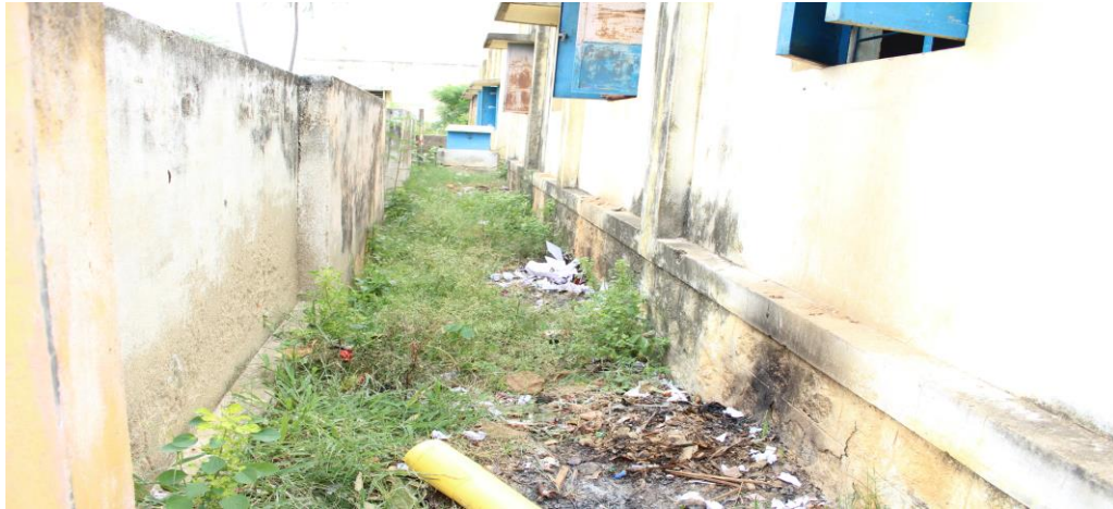
NSS Volunteers of Priyadarshini Engineering College, Vaniyambadi organize cleaning of streets and back alleys in Vellakuttai Village. (Before)